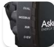
All the necessary inputs for the remote monitoring and control of the pump are included