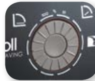
Simple to set with Press&turn dial. The operating mode symbol lights up when in use