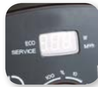
Display showing consumption